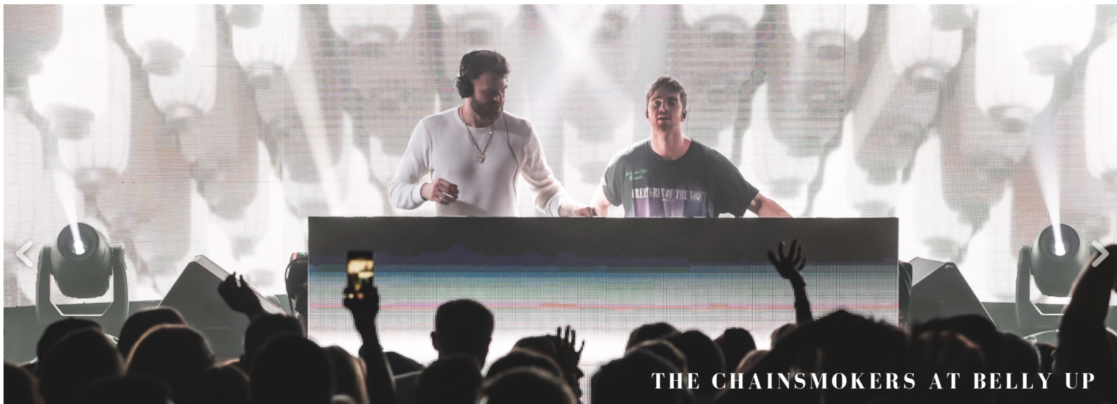
THE CHAINSMOKERS AT BELLY UP